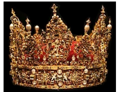
The crown of King Christian IV of Denmark